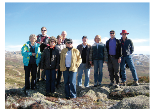
Members of the Perisher Historical Society on the side of Mt. Stillwell.