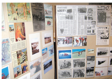
Images of an earlier period in the history of the Perisher Range Resorts.