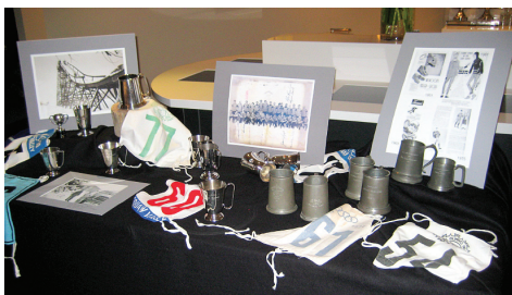
Some of Bill Day's donated Olympic memorabilia on display at Snow Gums Restaurant.