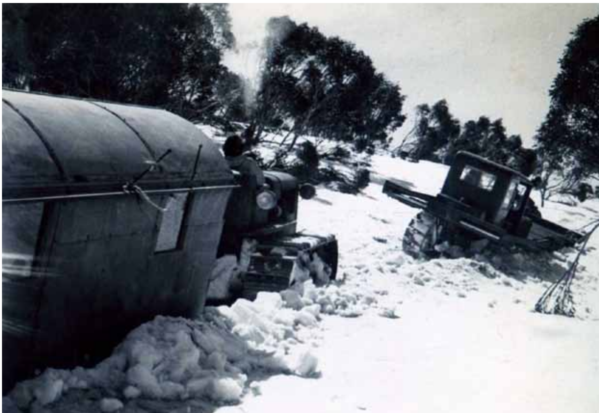
Motorised transport challenged by deep snow, October 1946.