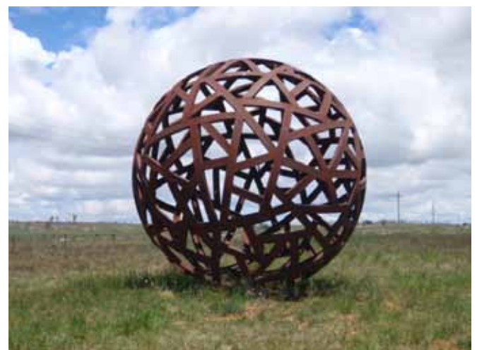
'Snowy River Sphere' by Richard Moffatt east of the Snowy Mountains Airport (photo by Dave Woods).

The artists were asked to consider the dramatic Snowy Mountains landscape, social history and aspects of economic development, and then create a large scale artwork that captured these elements. In assessing the artistic merit of the submissions, members of the shire's Public Art Advisory Panel also had to consider design, budget, excellence, relevance and maintenance. A number of locations were proposed by the shire's Public Art Advisory Panel, with final approval resting with the then RTA (now RMS).